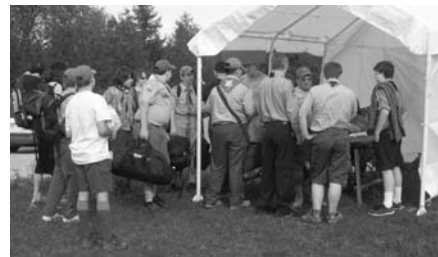
Youth start arriving on site and checking in at Registration