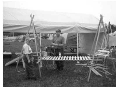
24th Brampton getting fancy with their kitchen area, but will the youth appreciate it?