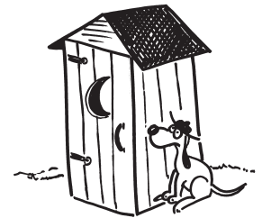
Ever wondered why they call it a KYBO? Ask your Canadian host.