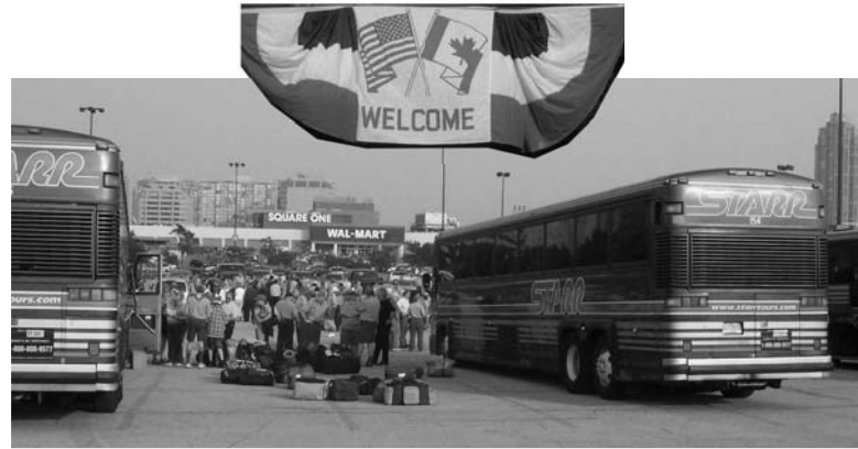
Offloading 6 buses of American Scouts at Square One in Mississauga and matching everyone up with their host families.