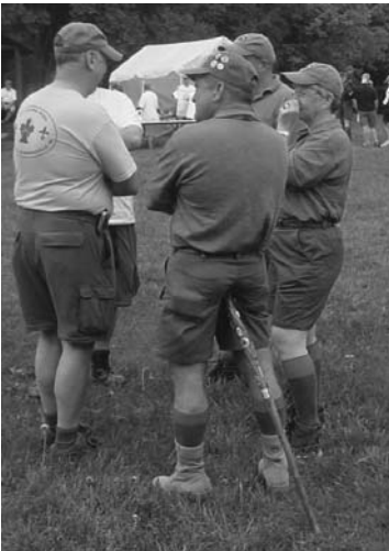
Winning Entry: I was told to lash together a tripod but I couldn't find the rope. Submitted by Anonymous